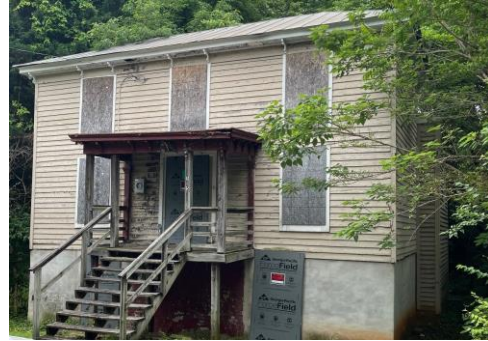
515 Jackson St.