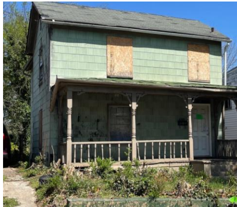
1510 Taylor St.