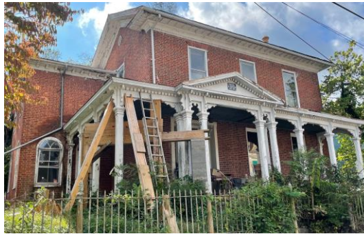
917 Federal St.