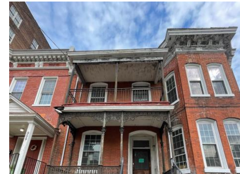
307 7 th St.