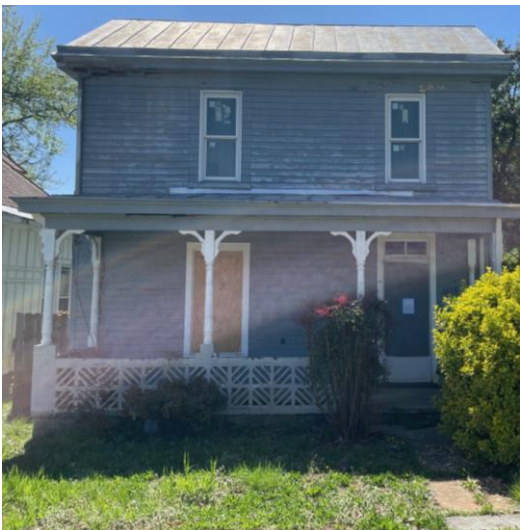
1619 Monroe St