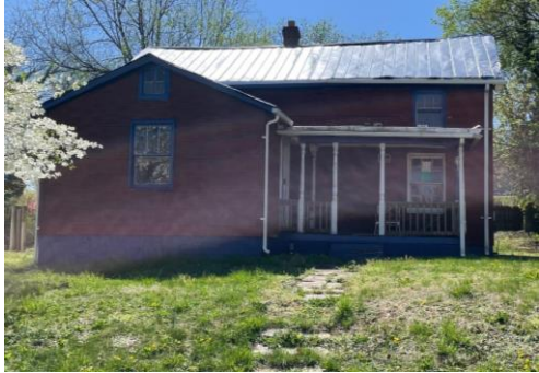
1209 Wise St.