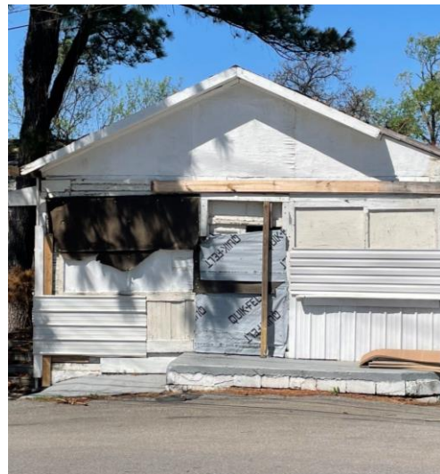
2530 Poplar St.