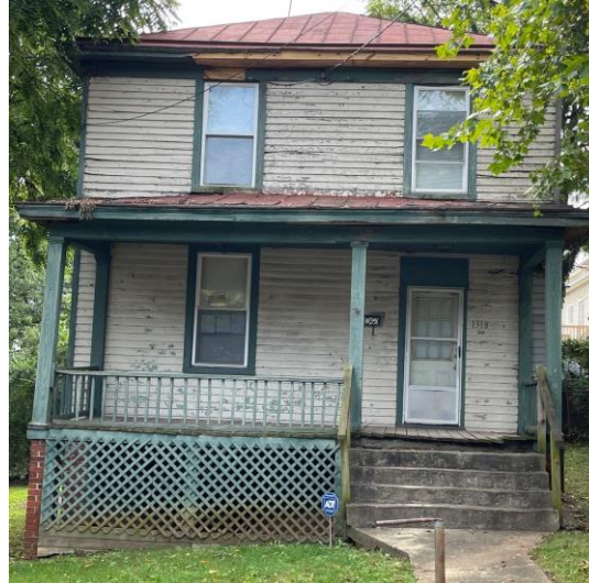
1318 16 th St.