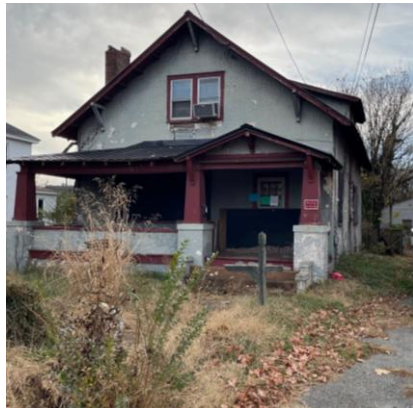
1319 Fillmore St.